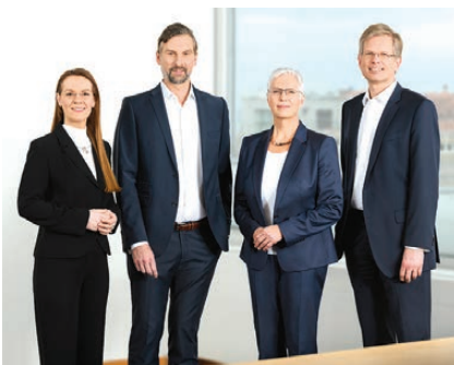
LEONI Board of Directors.

Sales for the Leoni Group in the 2021 financial year were up by nearly 25% at €5.1 billion (€4.1 billion in 2020), driven by a robust recovery of demand in sales markets in the first half of the year, but dampened in the second half by shortages and slowdowns in the international supply chains. The sales figures also reflected positive effects stemming from the price of copper in the 12-month view. Both the WSD and WCS divisions contributed to the positive trend in sales. www.leoni.com