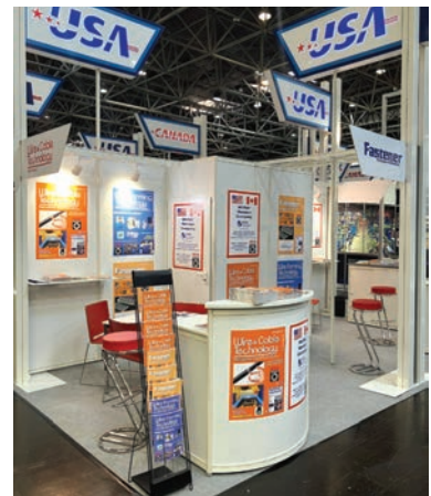
...continued on pg. 4, col. 1

The Wire and Cable Industry Suppliers Association® (WCISA®) of Akron, OH, USA, and many of its member companies exhibited at wire 2026 , in Düsseldorf, Germany, from April 13 to 17, 2026. Some exhibited in the North American Pavilion, and others exhibited on their own in one of the nine exhibition halls. The show's final press release stated that despite massive geopolitical challenges, disrupted supply chains, high tariffs and scarce raw materials, the Düsseldorf Fairgrounds were buzzing with activity. People at the show were discussing, developing and rethinking. The North American Pavilion was co-sponsored by Messe Düsseldorf North America and WCISA. See images below and on page 4.